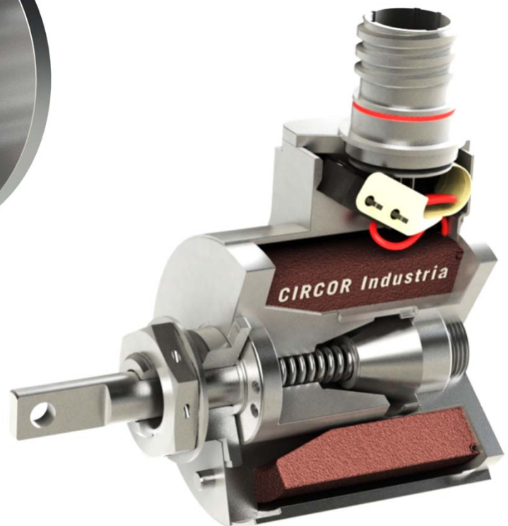
Pulling solenoid actuator